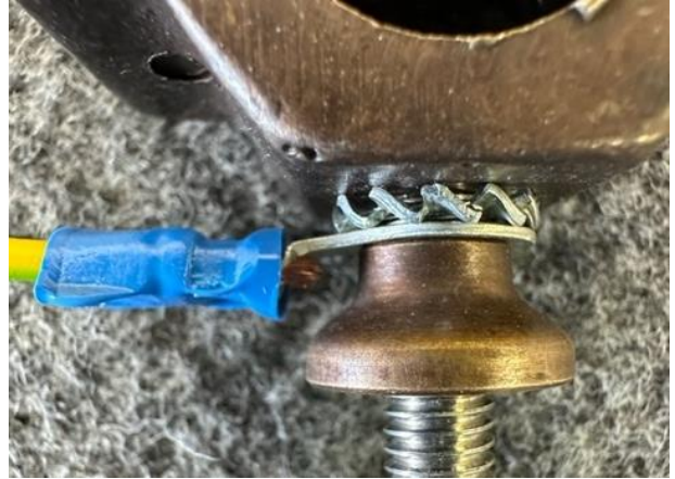
earth continuity system